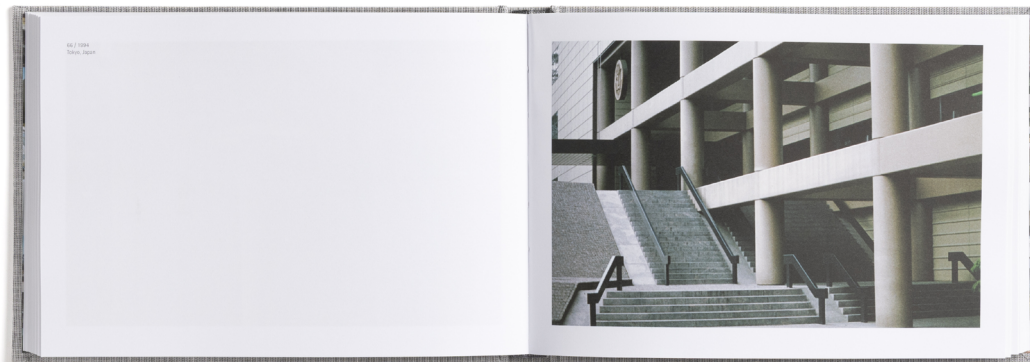
Tokyo, Japan. Photographed by Norman Foster in 1994.

Norman Foster (born Manchester, 1935) is the founder and executive chairman of Foster + Partners. Over more than five decades the practice's output has encompassed urban masterplans, public infrastructure, airports, civic and cultural buildings, offices and workplaces, private houses and furniture design. Major projects include Beijing Airport, the Millau Viaduct in France, 30 St Mary Axe (also known as the Gherkin) and the Great Court at the British Museum in London, the Hearst Headquarters tower in New York and the Museum of Fine Arts, Boston. Recent projects include Apple Park in California, Bloomberg's European Headquarters in London, the Comcast Tower in Philadelphia and the Norton Museum of Art in Florida. Some of his current projects within the practice include 425 Park Avenue in New York, the Narbo Via museum in Narbonne, the Magdi Yacoub Global Heart Center in Cairo, the community boathouse in Harlem, and the Headquarter Tower for JP Morgan Park Avenue in New York. He is president of the Norman Foster Foundation, based in Madrid with a global reach, promoting interdisciplinary thinking and research to help new generations of architects, designers, and urbanists anticipate the future. Lord Foster of Thames Bank was appointed by Queen Elizabeth II to the Order of Merit in 1997 and in 1999 was raised to the peerage in the Queen's Birthday Honours List. He is the President of the Royal Fine Art Commission Trust and leads the Forum of Mayors for the United Nations.